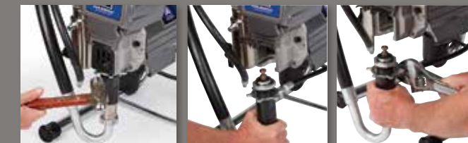
1. LOOSEN LOCKING NUT

Airlessco keeps you productive with the Quick Repair Pump system. Reduce downtime and change the pump on the job — no special tools needed!